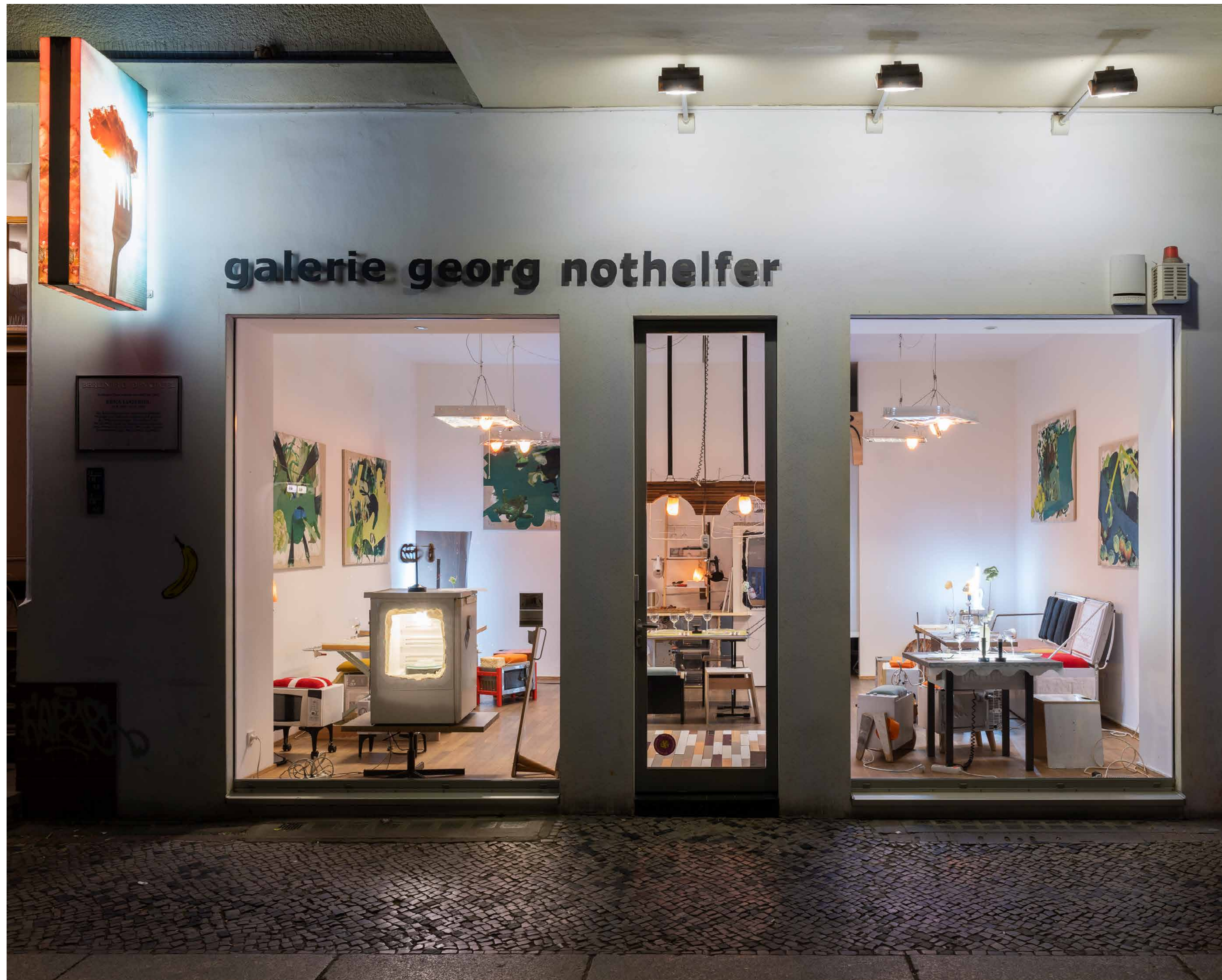
Sülzensaal street view on restaurant-riden Grolmanstraße