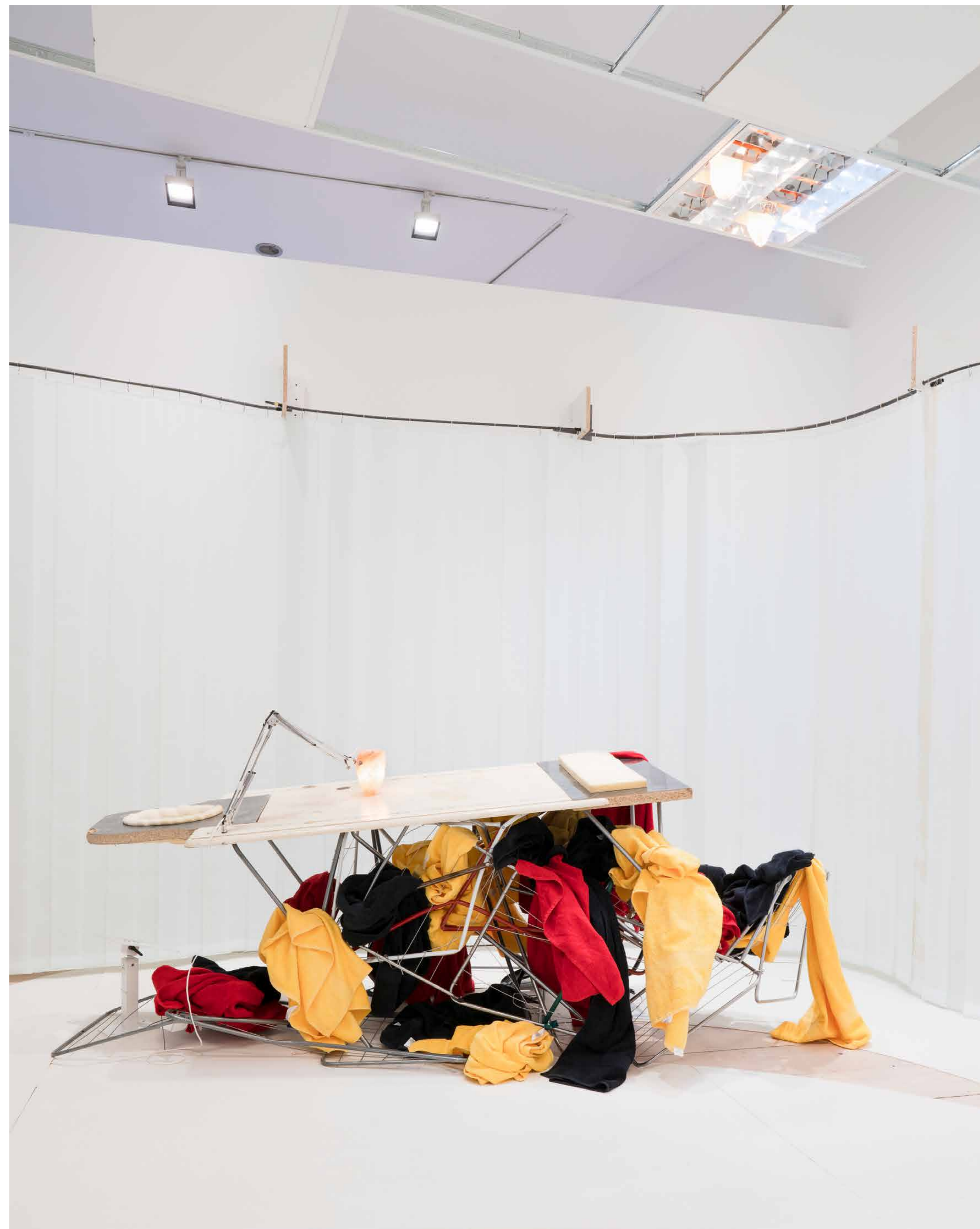
The walls were lined with vertical blinds, the oils stored in the “Billy-Oil-Bar” and the visitors massaged on german flag colored towels, that were collected under the massage table for mental massage.