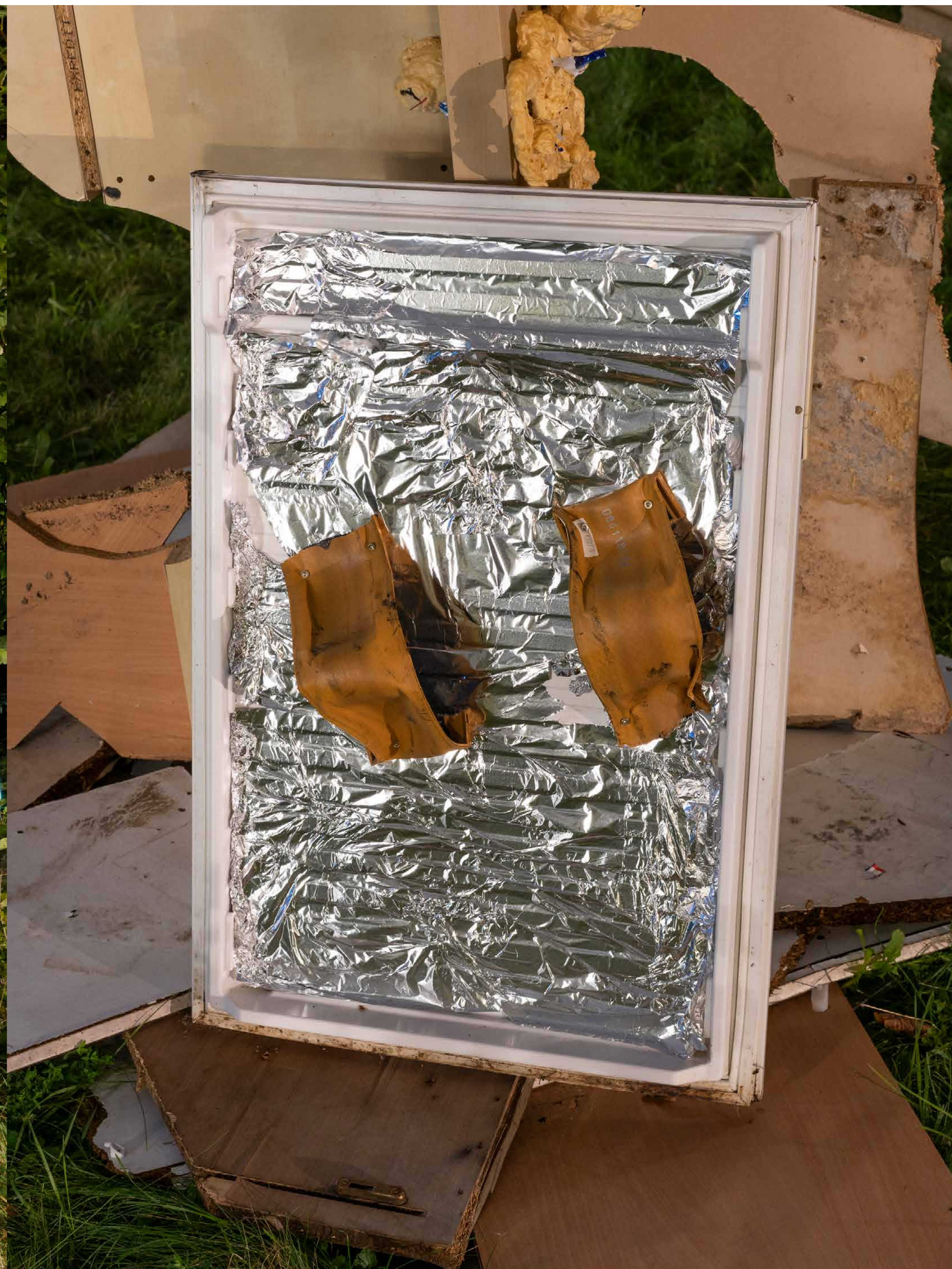
Perseus and Medusa, Mirror Shield and Pegasus.