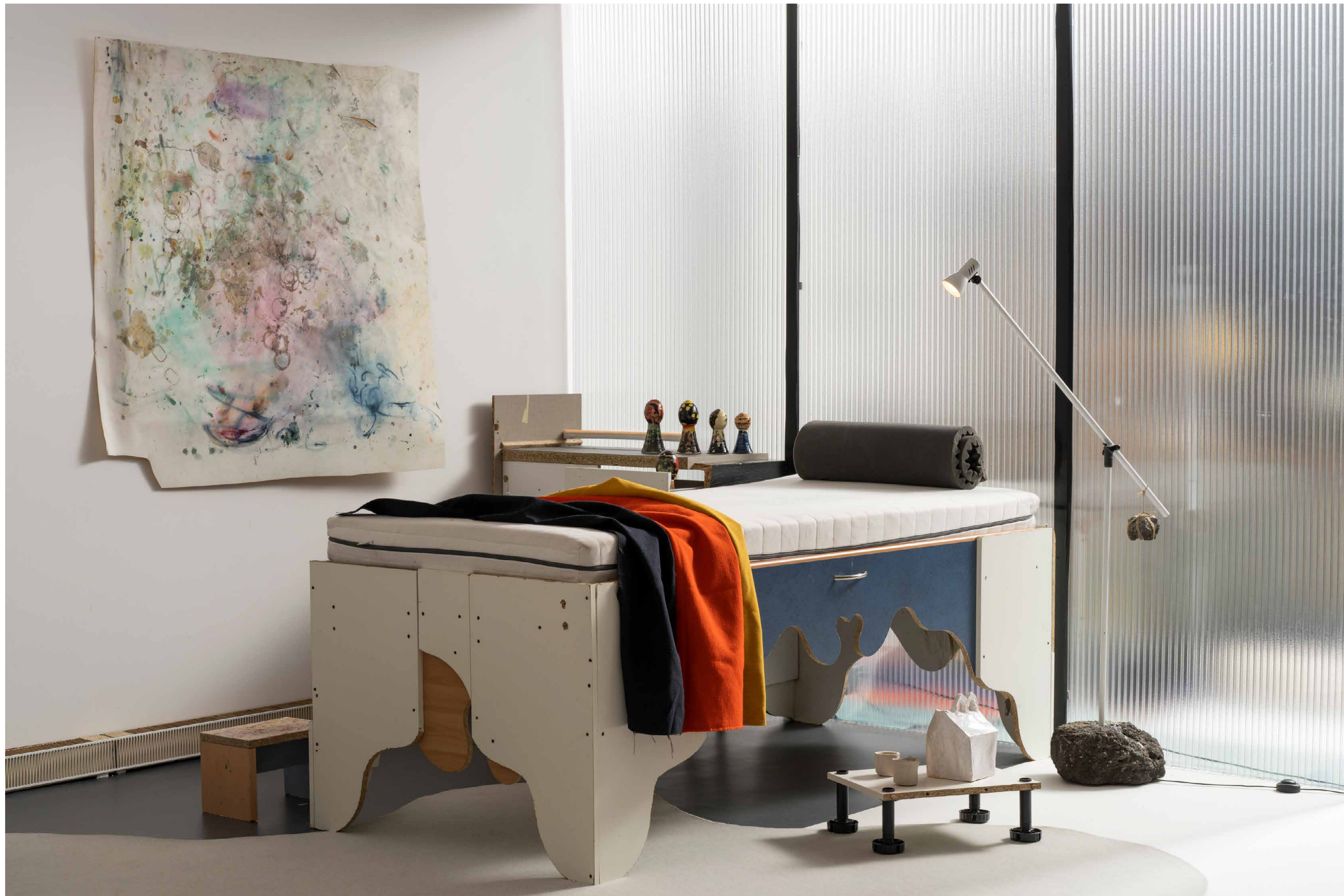
Wanddekor Objekt Can-Can Sideboard Fatherbed Aesphald Lamp I Tablet with content tea-pot