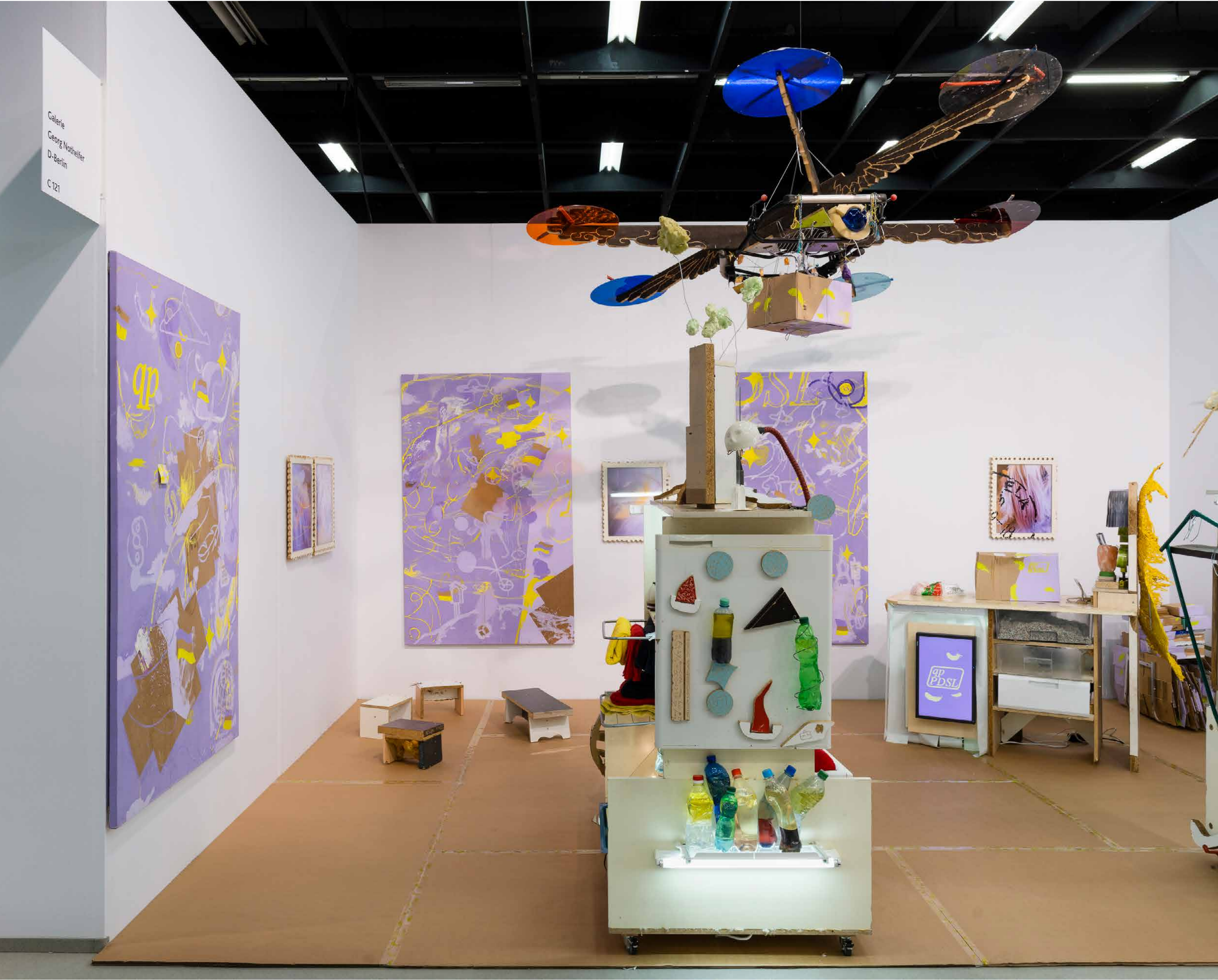
qpPDSL franchise booth at ArtCologne. The shelves carried artefacts of other Pegasus Products. The walls were adorned with Corporate Identity paintings and Sissi Memorial Stamps.