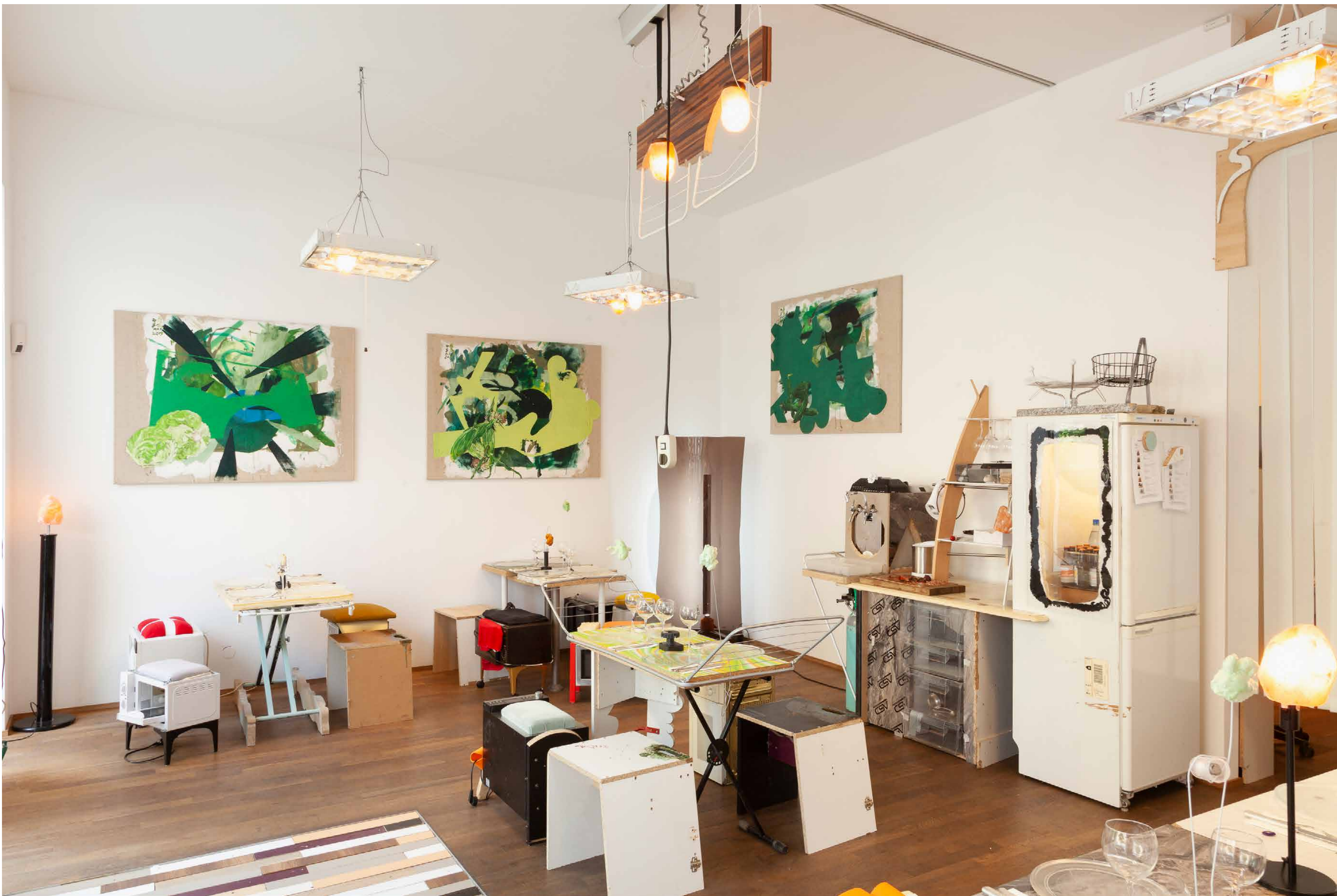
The seating was made from old microwaves and fridges.