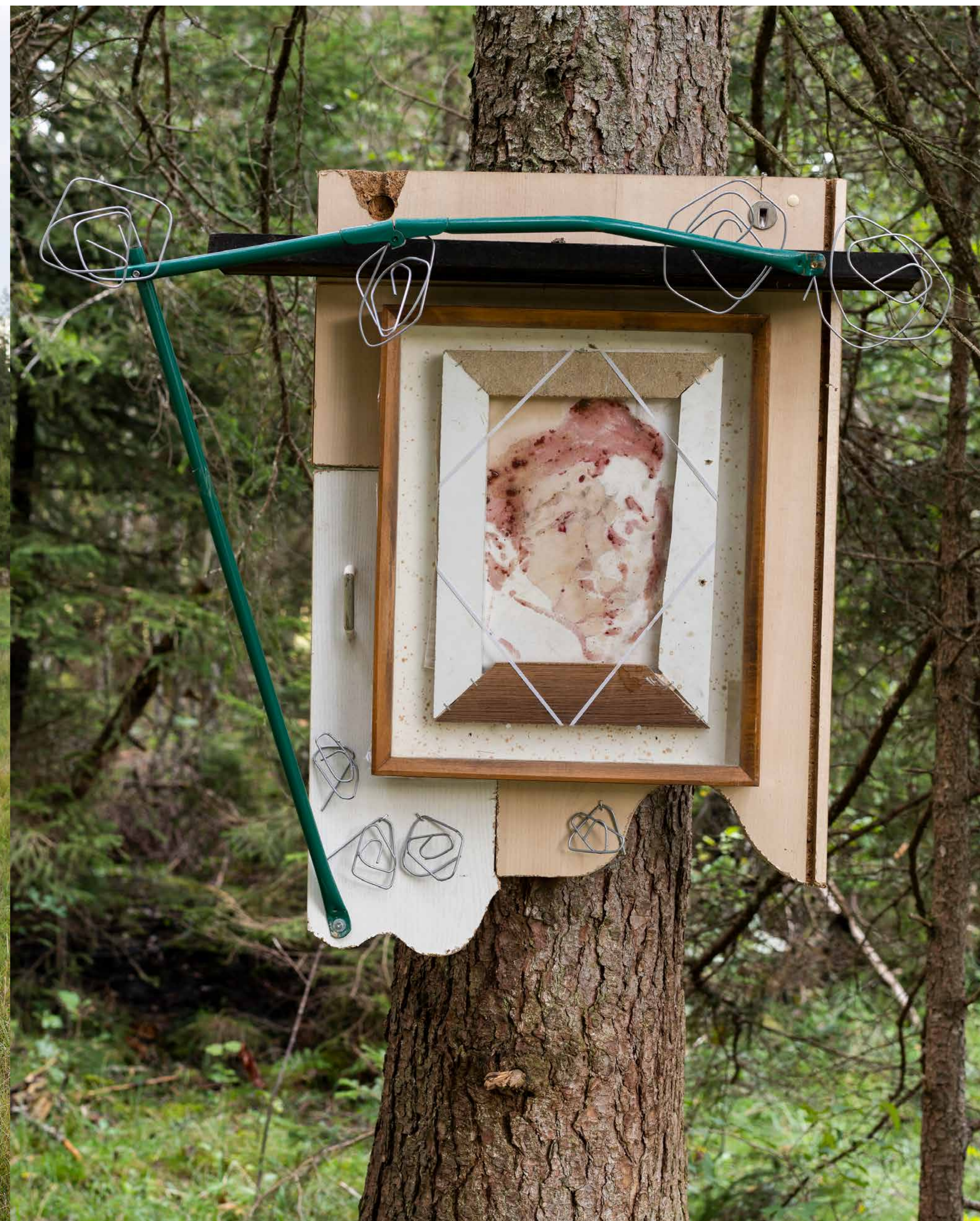
Edlvis Shrine #5.