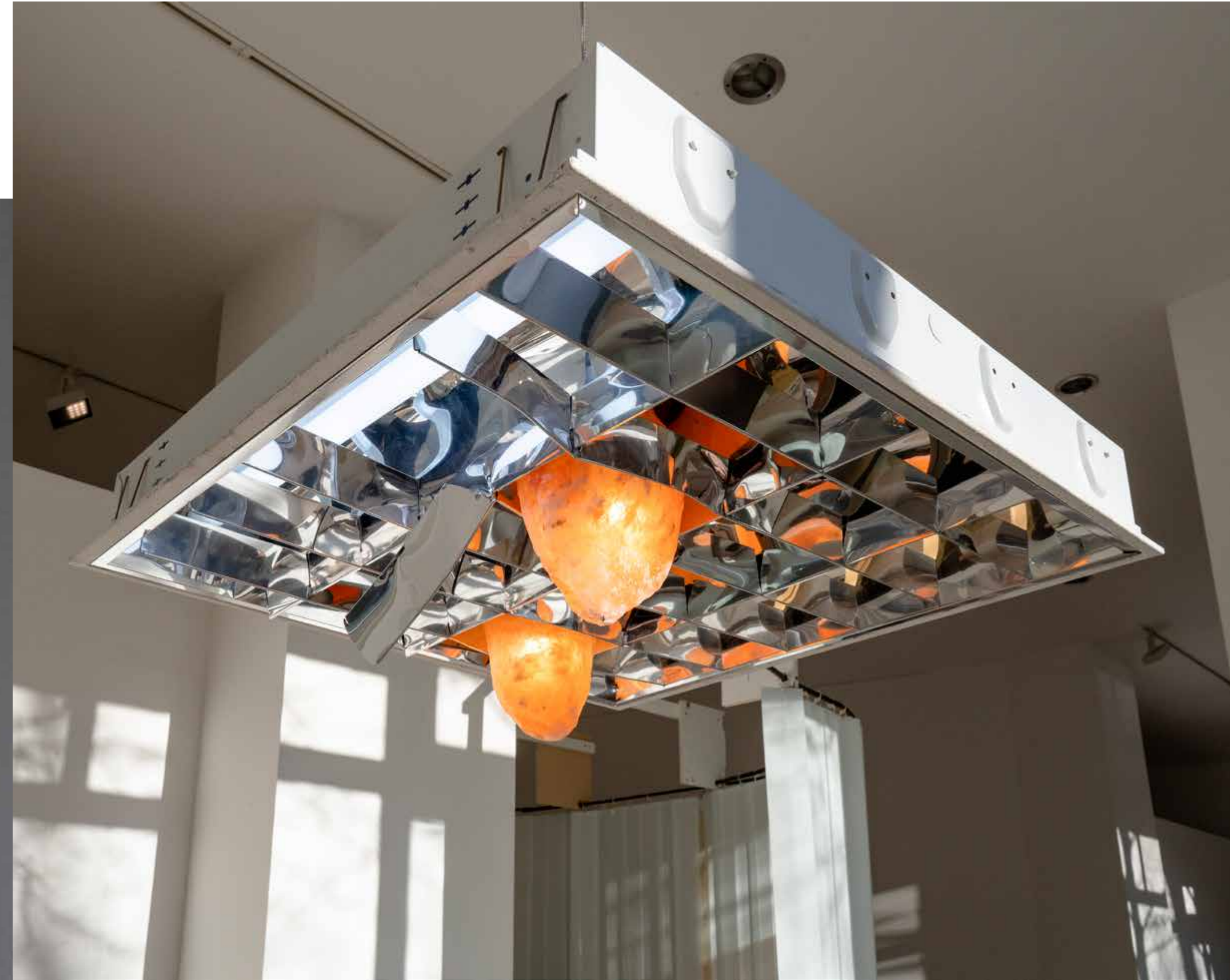
Unbequeames Throne Beacon Lamp Kristall Lampe Lampe in Taxes and Tantra anamnesis lounge.