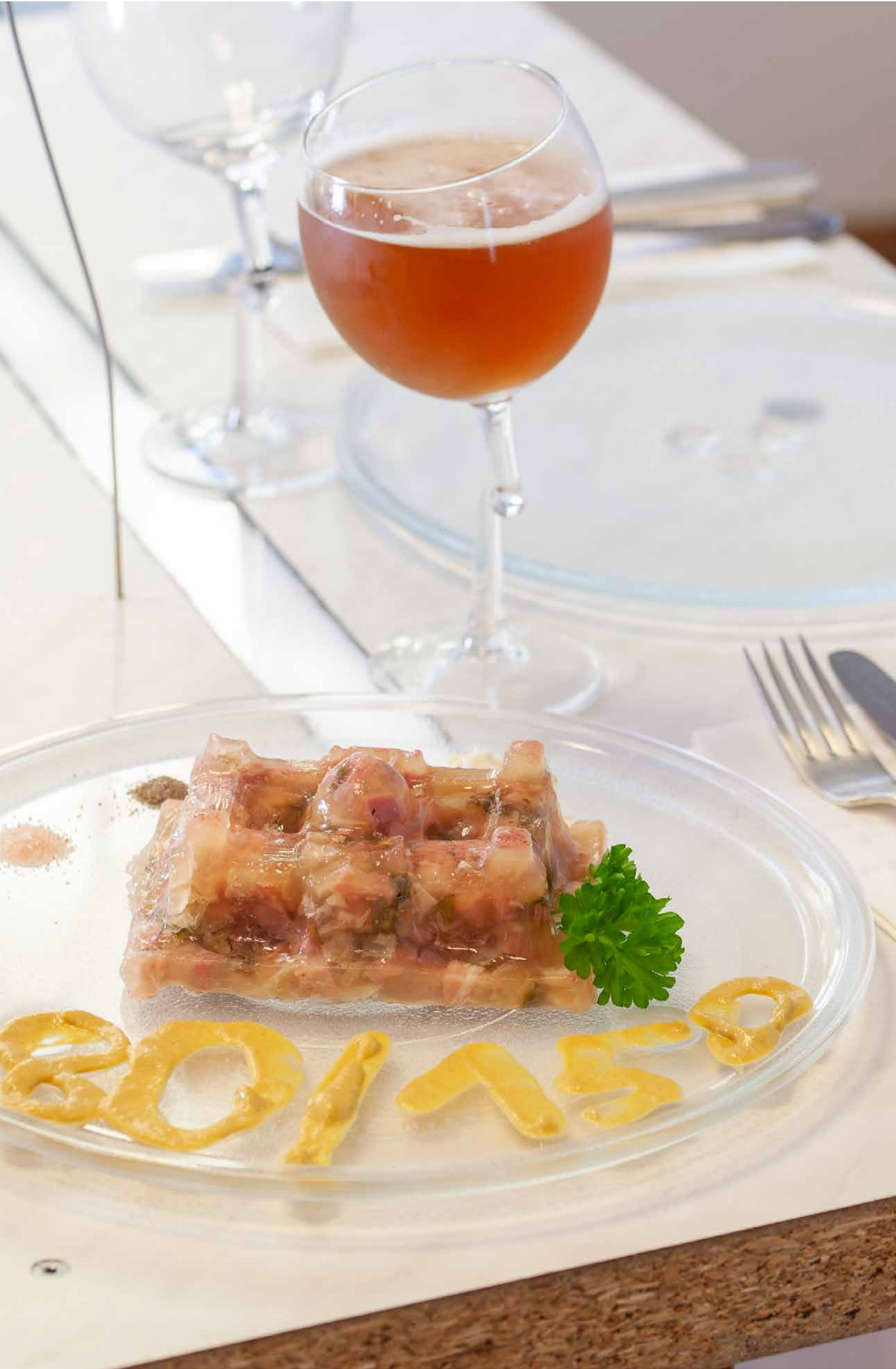
An edition of 150 servings of head cheese could be enjoyed with beer, served from kettles, the edition number written on the plate in mustard and the napkin served as edition certificate.