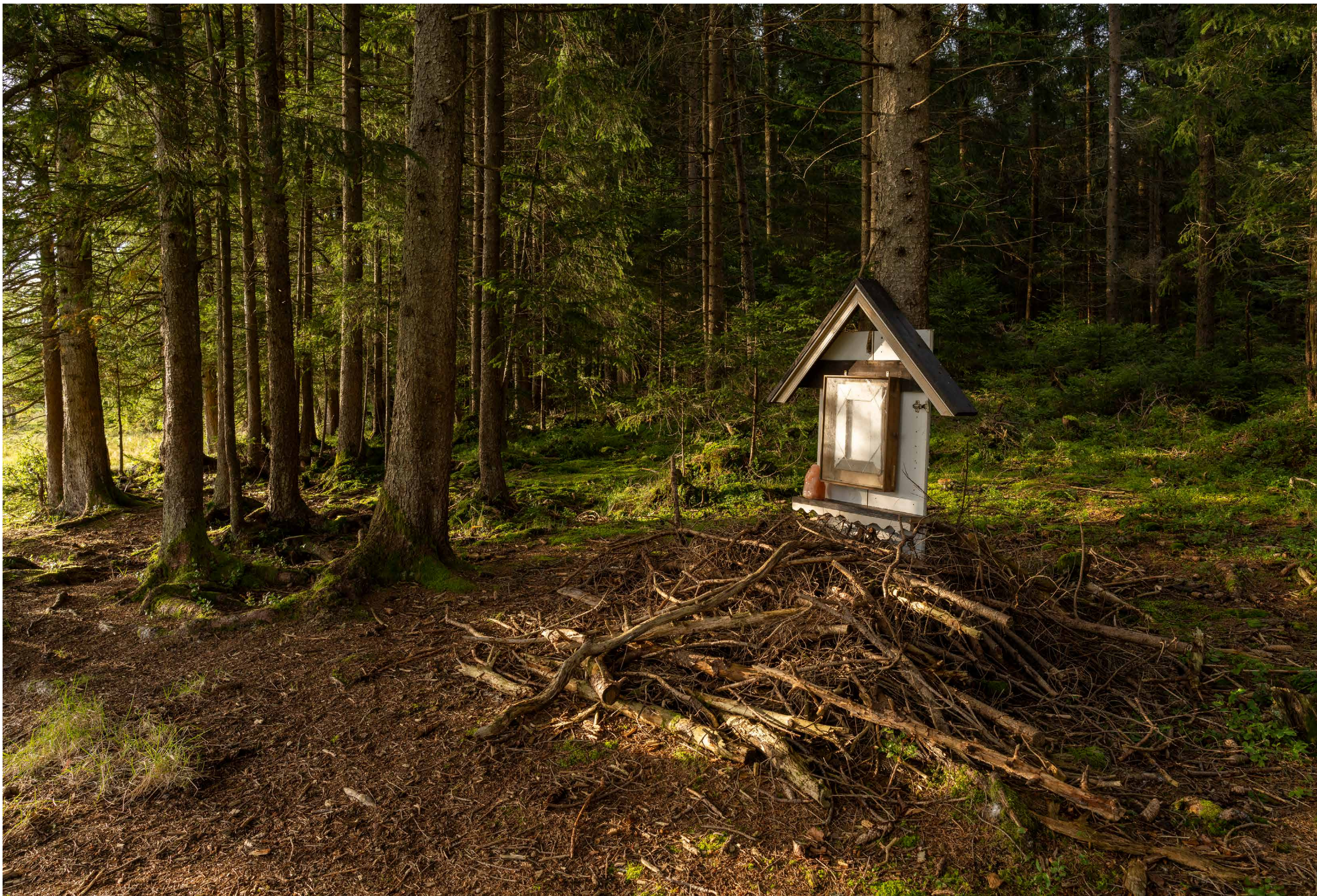
Edlvis Shrine #8.